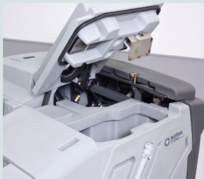
Cleaning of the machine is easy thanks to the tip out recovery tank opening with debris tray.