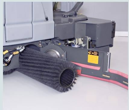
Maintenance is quick because replacement and adjustment of squeegee blades, side blades, and brushes require no tools.