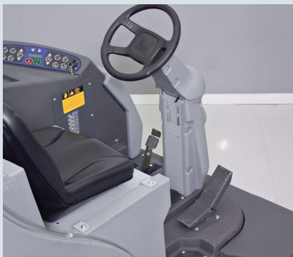
The new Kubota engine improves user comfort through reduced vibration.