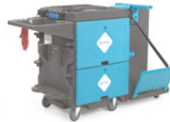
i-land XL Pro