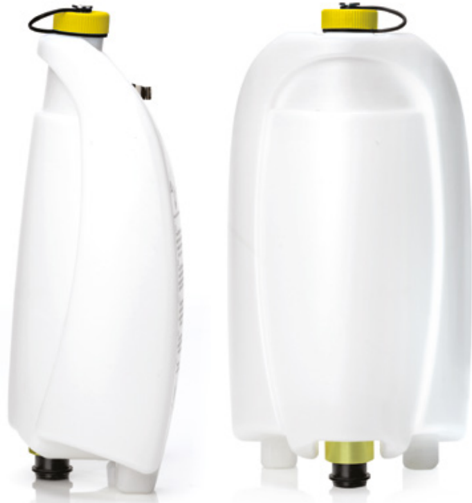
solution tank yellow ● wash basins & washroom surfaces