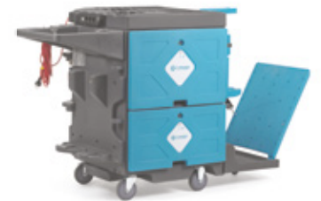
i-land XXL Pro