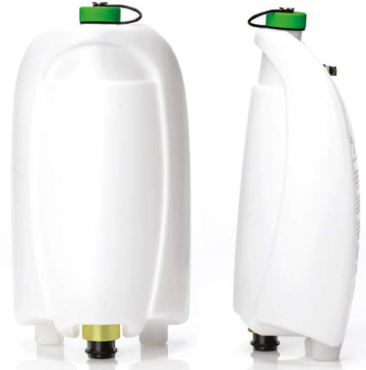
solution tank green ● general food & bar use