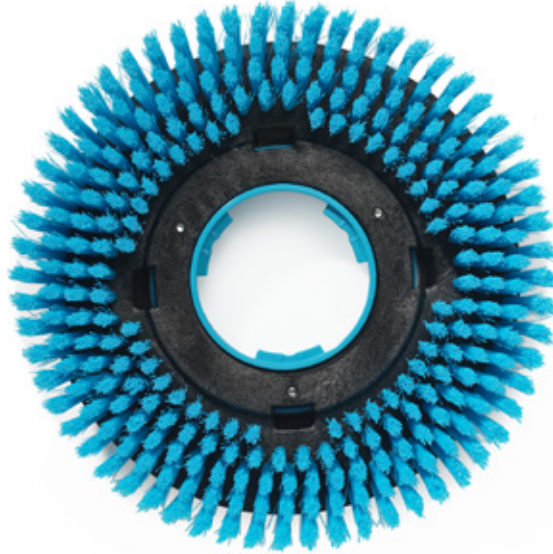
Medium brush (standard)