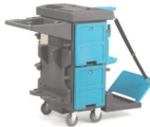
i-land L Pro