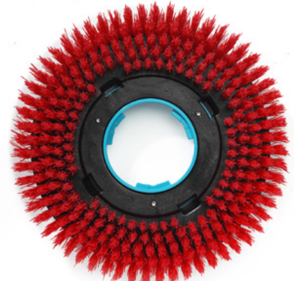
Hard brush (optional)