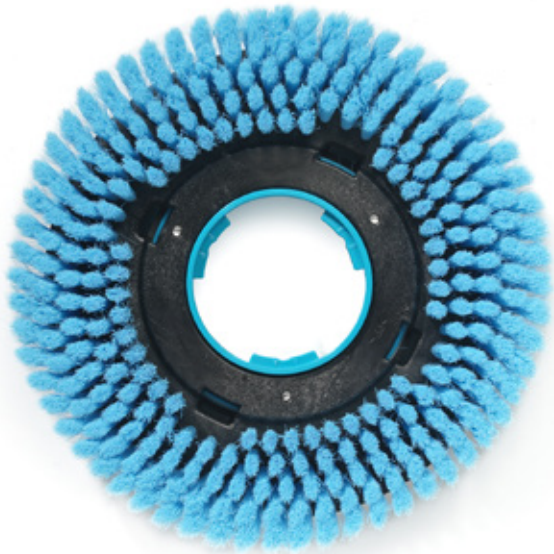
Soft brush (optional)