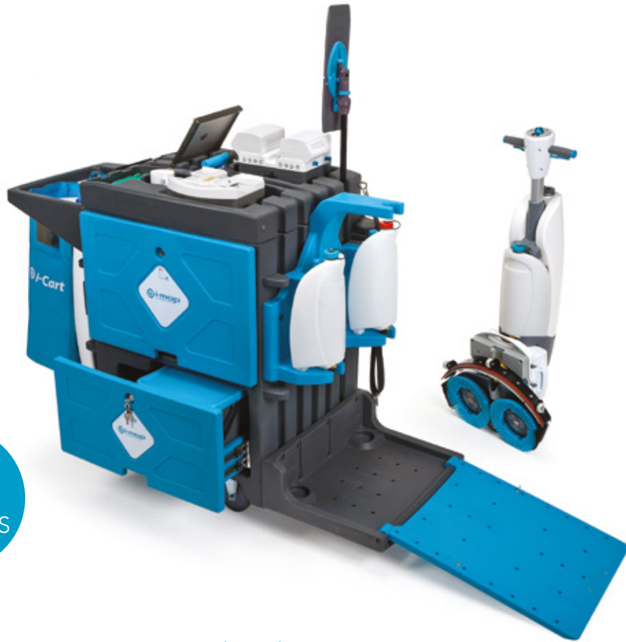
i-land XL Pro