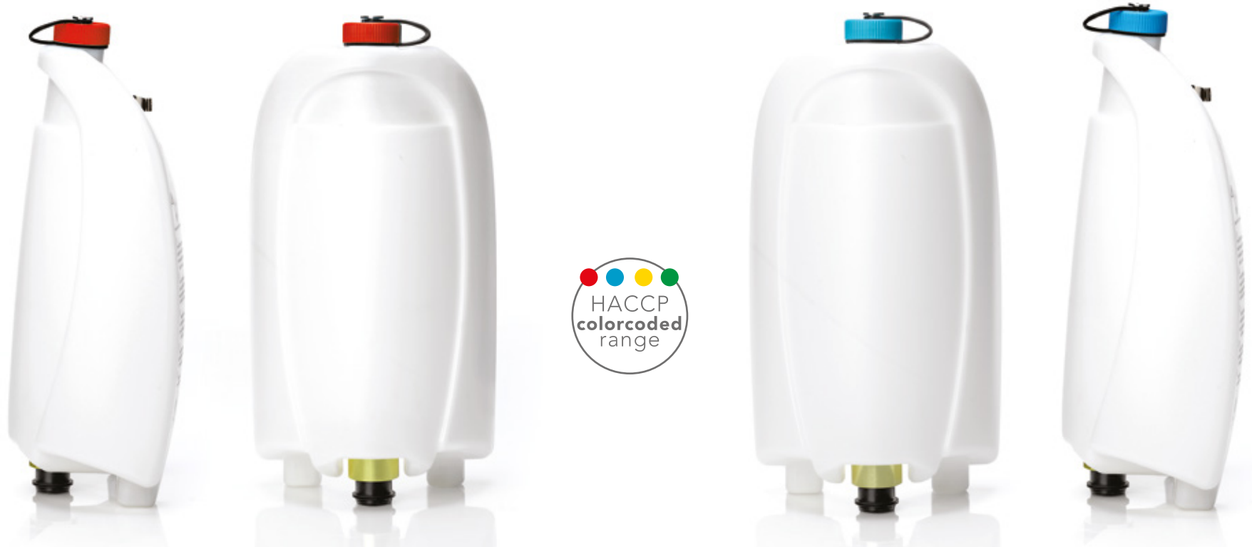
solution tank red ● sanitary fittings & washroom floors