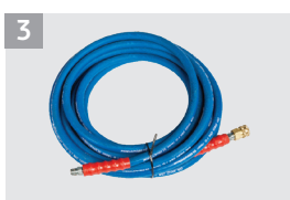
3. 10m Hose