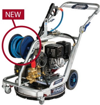
Hose Reel position for improved functionality.

// Being able to switch between the two cleaning configurations makes it a very handy machine. //