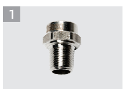
1. 4000 psi Rotary Nozzle