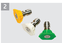
2. 4000 psi wand nozzle with 15, 25 & 40