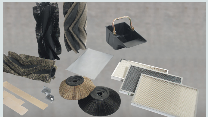
Large range of optional accessories provides the right tools for specific jobs e.g. carpet kit, special filters and brushes, overhead guard, 2x18 litres hopper containers etc.