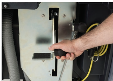
A simple mechanical deck lever removes the complexity, unreliability and service costs associated with alternative methods.