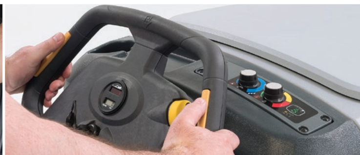
No confusing buttons or switches for a simple and easy to use machine.